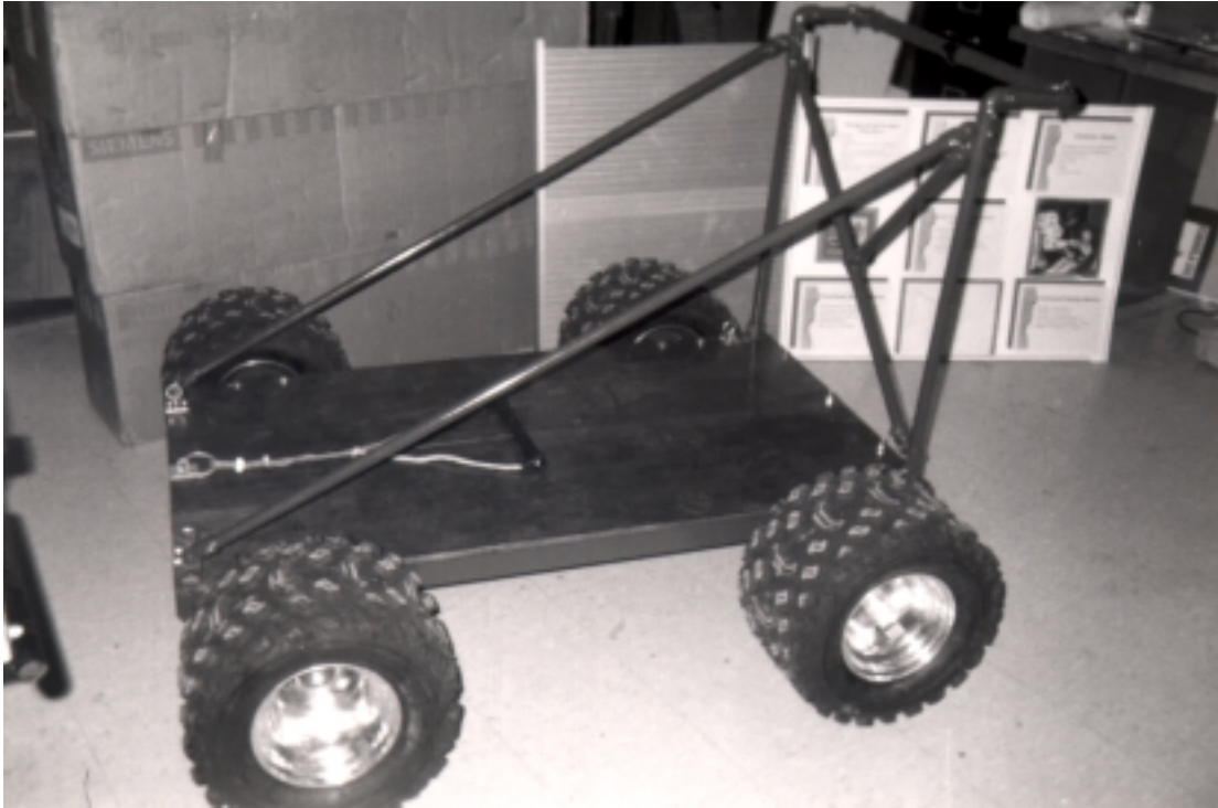
Figure 13.1. Beach Wheelchair Transporter.